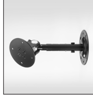
MK1-GR: RoadGear Speaker Wall Mount Kit