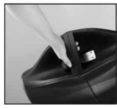
Molded handle and handy docking locks for ease of transportation