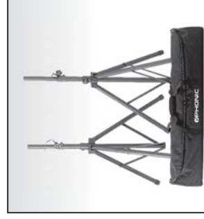
SK 1: 2x Speaker Stands, including carry bag