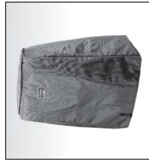
TR-RG: RoadGear Travel Bag