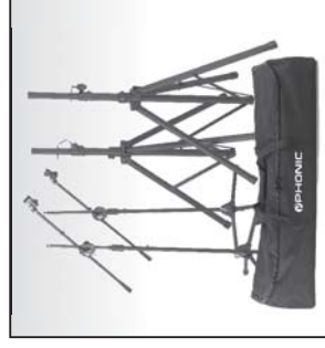
SK 2: 2x Mic Stands & 2x Speaker Stands, including carry bag