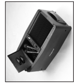
Amazing storage space for your microphones, cables and much more