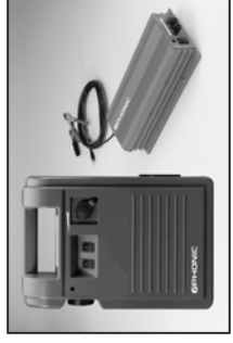
BP-RG: RoadGear Battery Pack