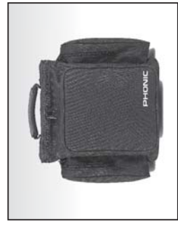
BG-RG: RoadGear DC Power Accessory Bag